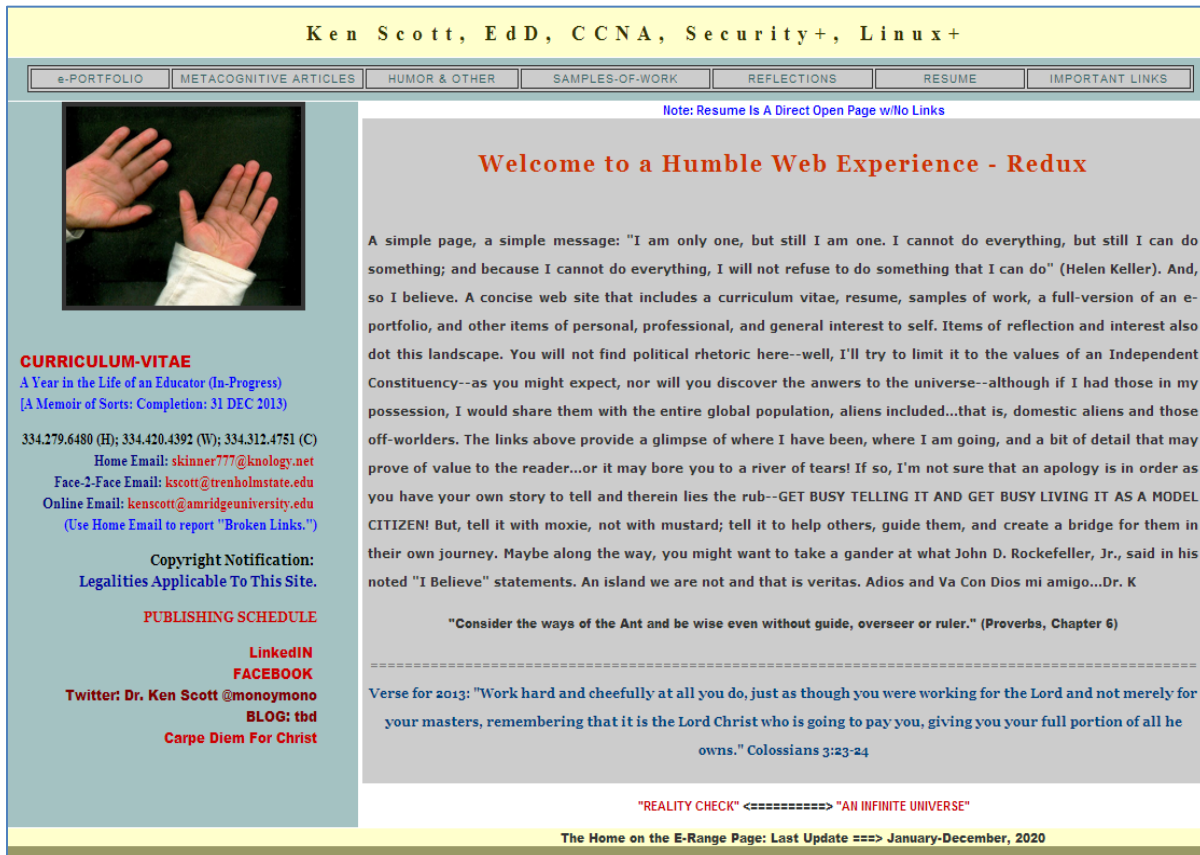
Figure 2. An example, not a model for boasting!